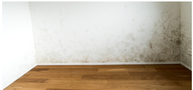
Condensation has led to mould problems on the drywall.

Newly constructed homes may temporarily exhibit a higher potential for condensation as moisture in plaster, cement and other building materials escapes into the air during the first heating season. This elevated level of moisture in the air should taper off after a month or two. If it doesn't, you should inform your building or maintenance manager of the situation.