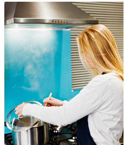
Use your kitchen exhaust fan or range hood to remove humidity generated by cooking. The exhaust fan should be vented to the outside.