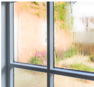
Condensation forms first on the coldest surfaces of a room, usually on glass surfaces of windows and doors.

Condensation forms first on the coldest surfaces of a room, usually on glass surfaces of windows and doors. These surfaces are typically cooled by lower exterior temperatures during the winter months much more easily than the walls which are kept warm by insulation. For example, if it is cold enough outside and/or warm and humid enough inside, condensation may occur on or around your windows resulting in fogging, water or ice on the windows themselves or even a puddle of water on the window frame or sill. Other examples of condensation in your home can include damp spots or mildew on outside wall corners, closet walls or baseboards. Areas of your home with poor air circulation, such as behind furniture or in a cupboard or closet, can also be susceptible to condensation.