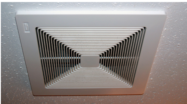
Use bathroom fans, and humidistats if you have one, while bathing or showering.

In most cases you can address high humidity and condensation through reducing the amount of humidity generated in your home. Ventilation may only reduce humidity levels if the air introduced into the room is drier