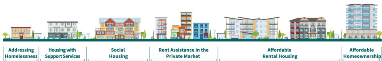
Figure 1: Housing Continuum

This program framework outlines the overall program intent, goals, principles, target populations, core elements, standards and guidelines, monitoring and reporting requirements, and defines the roles and responsibilities of the project partners in the delivery and management of the program.